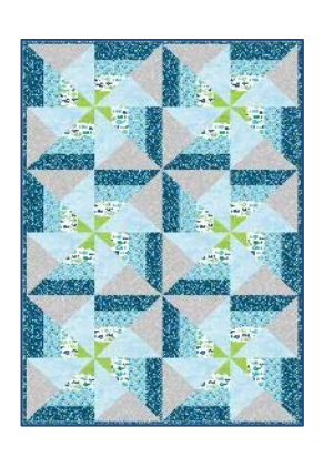
# 202 Six Design Variations Blocks On The Move (Alt. view in the class list)