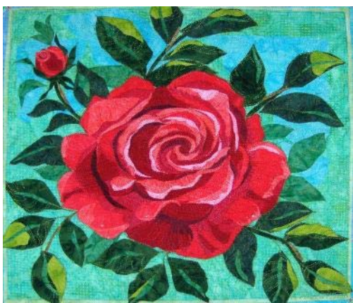
# 205 - Summer Rose Wall Hanging