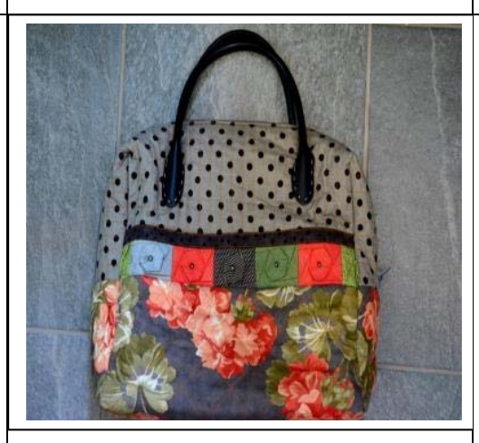
#208 - Two Fat Quarter Tote