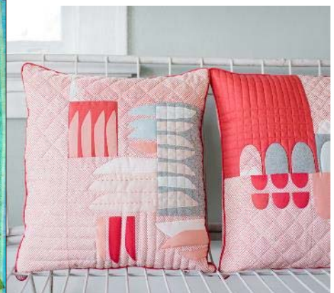
#206 – Hesperides