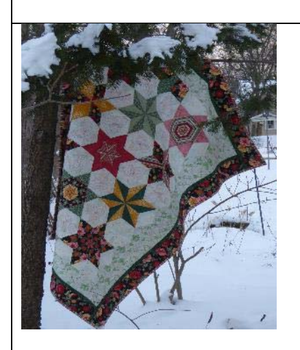
#207 - Diamond Stars