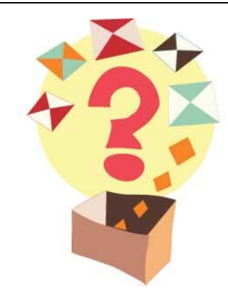
#203 – Jewel Peaks Mystery Quilt