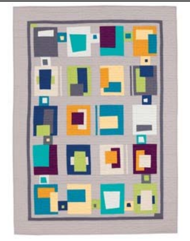
#201 - Paint Chips