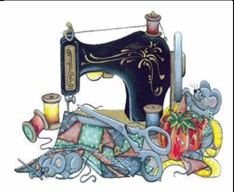
#209 - Come Quilt with Me