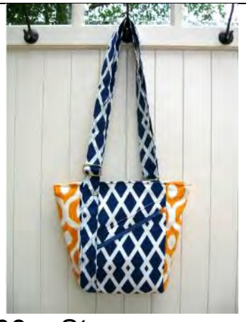
#108 - Stowaway