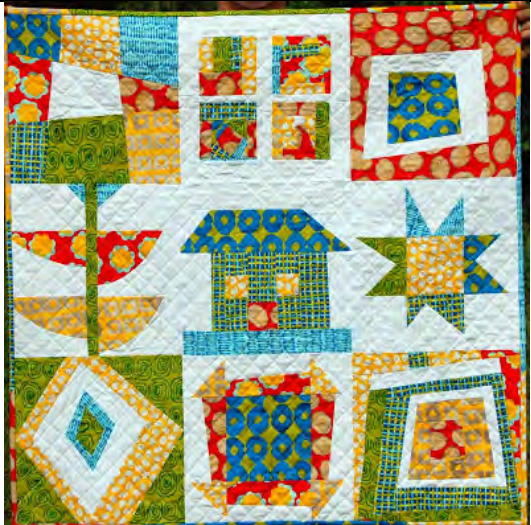
#104 – Modern Improv