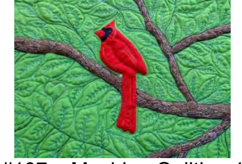
#107 - Machine Quilting 1 & 2