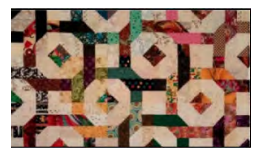
Over & Under Rainbow done in batiks