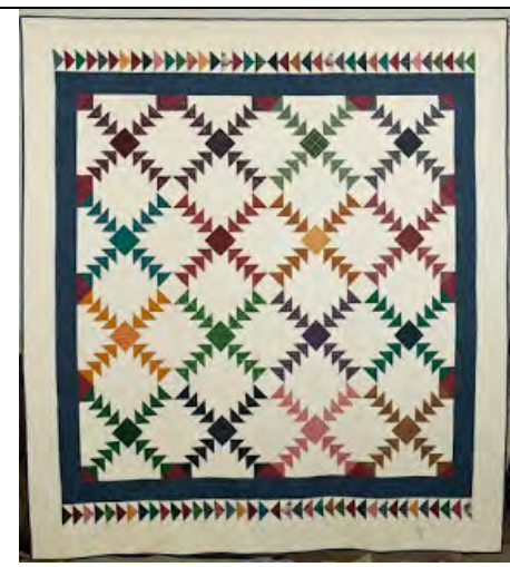
#101 – 5 Easy Pieces