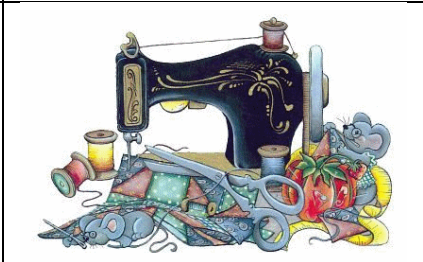
#109 - Come Quilt with Me