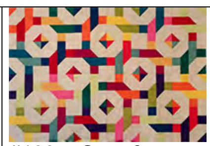
#103 - Over & Under Rainbow