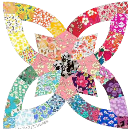
#202 – Brimfield Meadows