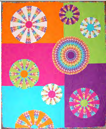
#204 – Carnival