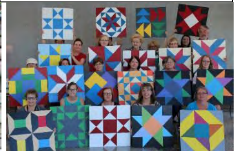
#206 – Barn Quilt Painted Block