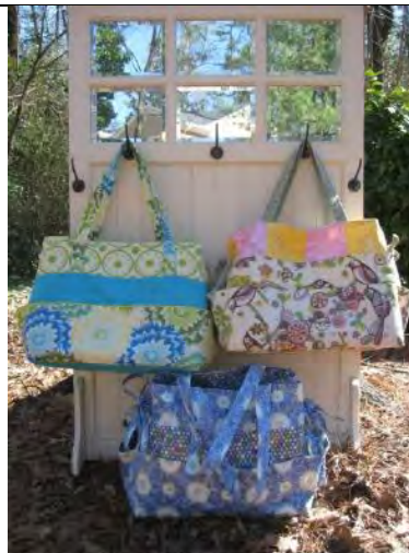
#208 – Whole Shebang