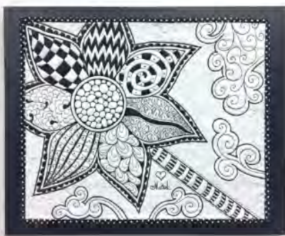
#207 – Zentangle