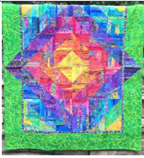
#205 – Yes Ma'am