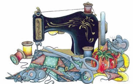
#209 – Come Quilt with Me