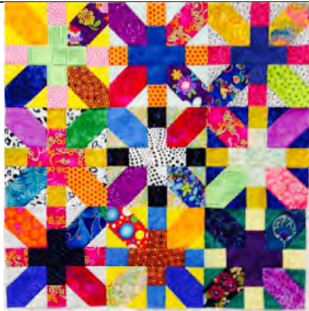
#201 – Kisses & Hugs