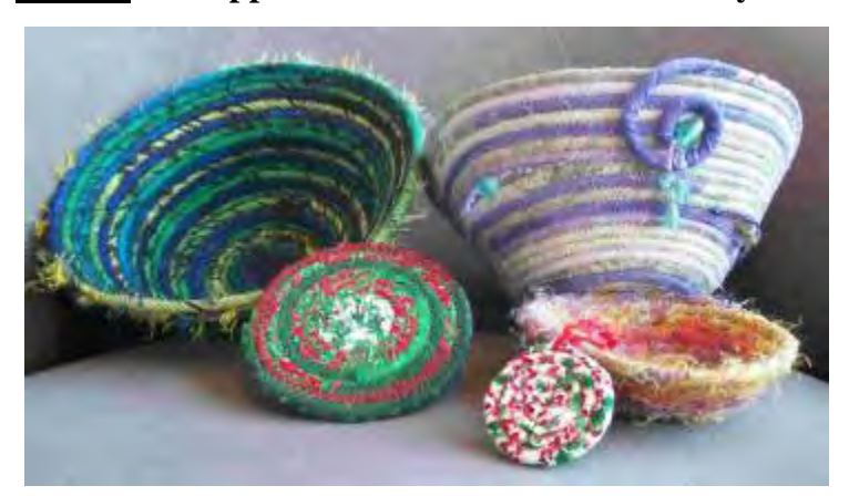
Class C: Wrapped Fabric Bowls with Elaine Myers

Skill Level: All levels Machine Class - These quick, fun bowls are made from fabric strips wrapped around clothesline, coiled and stitched. After learning the basics, you can experiment with various shapes and embellishments. This technique also works for placemats, coasters, even hats! You WILL have a completed project – AND a new addiction!!