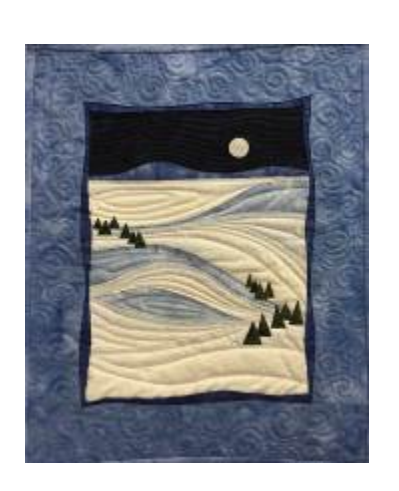
Skill Level: Beginner to Intermediate

<u>Machine Workshop:</u> Learn the technique of cutting and layering your fabric and create your own original little landscape. This workshop will cover the fabric selection, cutting, layering, top stitching, quilting and embellishment. You will be on your way to finishing this project by the end of the workshop. <u>There will be a maximum number of 12 students for this workshop and it is important that those attending do all their fabric pre-cutting as instructed below.</u>