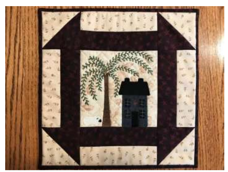
Skill level required - Beginner

Start with the completed quilt block and learn the basics of wool applique. Nearly complete or complete in class.