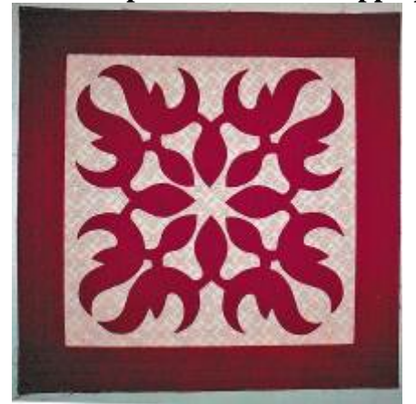
Workshop D: Needle-turn applique with Audra Rasnake

Description: Needle turned applique involves using the point and the shaft of a needle to turn under the raw edges of applique fabric as it is stitched down onto the background fabric. This class will teach the basics of this technique. You will learn how to draw out your pattern, baste it down, and then applique it onto the background fabric. You will learn to do inside and outside curves and inside and outside points...the four basic techniques needed to do all applique. We will be using the folded cutwork technique and cut our patterns out of freezer paper.