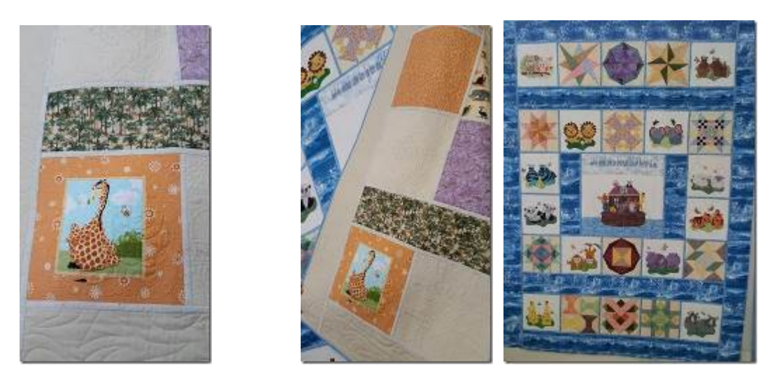
Sample Quilt Back