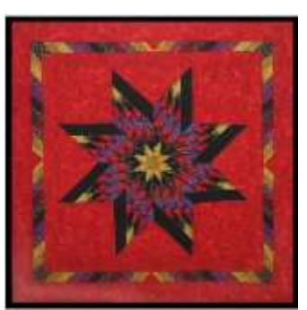
#204 – Not Quite a Lonestar