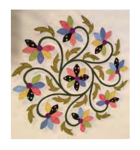
#101 - Pirouette Delaware