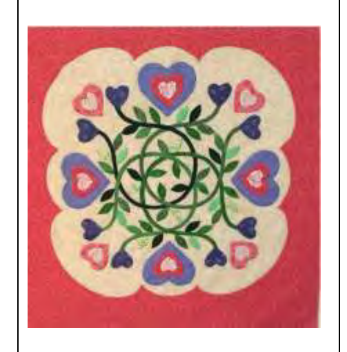
#201 – Lover's Lyre