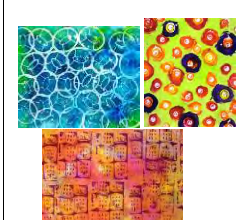
#208 – Soy Batik Fabric Design

#207 – All Dimensional Curves Mystery Quilt