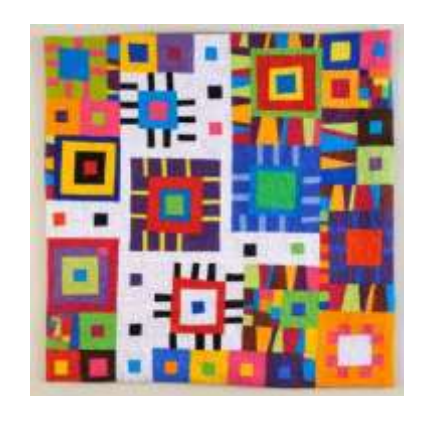
#205 - Happy Days