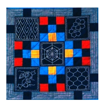
#103 - Sashiko