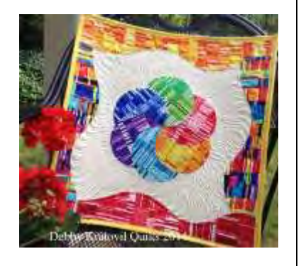
#106 – Tight Knit Circles