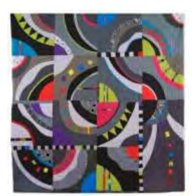
#105 – Twist & Shout Fabulous Freehand Curves