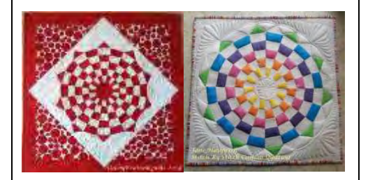
#206 – Modern Vortex Choose a two-color option or a multi-color option