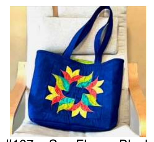
#107 – Sea Flower Block Tote Bag