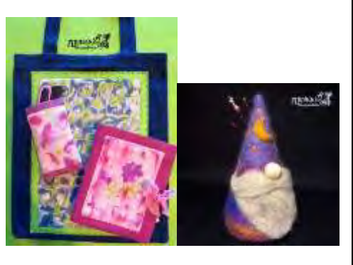
#202 – Wool Marbling & Stenciling, Needle-felt Gnome