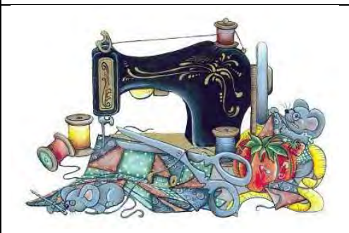
#209 - Come Quilt with Me