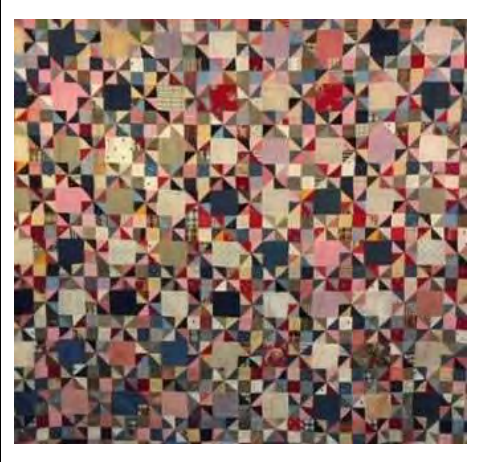
#203- Swartz Creek Scrap Quilt