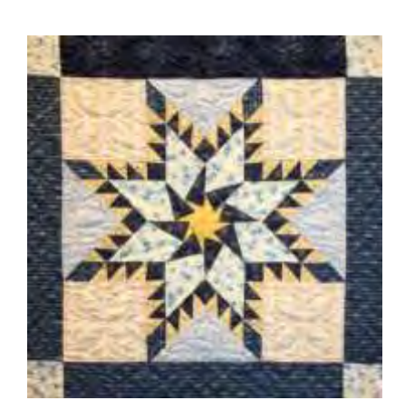
#104 - Feathered Star